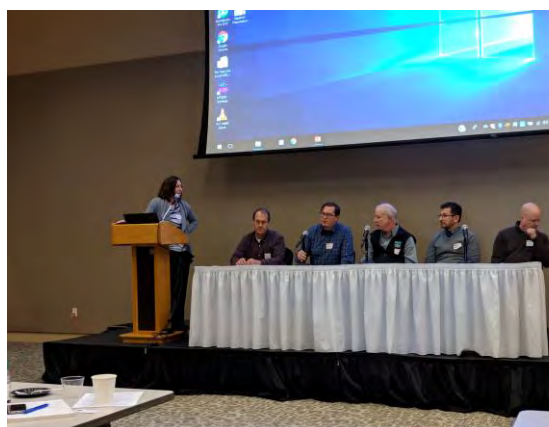
2018 NFFA-WMC Workshop in Silver Spring, MD

On Tuesday, April 10, 2018, the NFFA and the WMC hosted the first of the three planned workshops at the Tommy Douglas Conference Center in Silver Spring, Maryland entitled, “Exploring Opportunities for Integrated Mapping and Functional Assessment of Riverine and Coastal Floodplains and Wetlands.” The overall goal of the initial workshop was to discuss current and potential opportunities to integrate geospatial mapping and functional assessments of coastal and riparian wetlands and floodplains, in order to improve land use decisions and resource management and to reduce risk from the impacts of flooding, sea level rise and other extreme weather events.